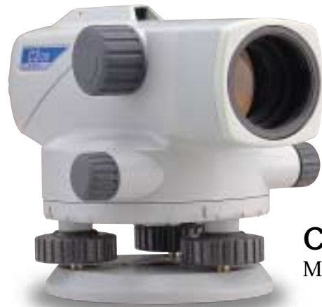
C300 Magnification 28x

All C3 models meet JIS grade 4 specification for waterproofing (this complies with International Electrotechnical Commission Standard, Class IPX4).