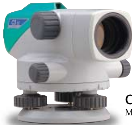
C310 Magnification 26x