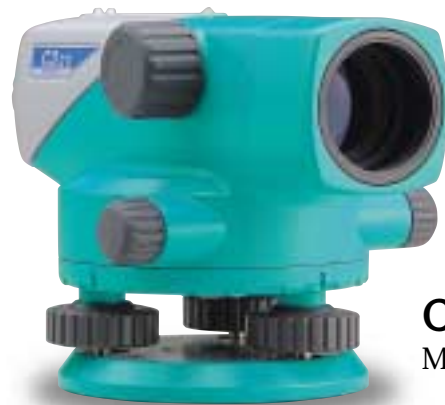
C320 Magnification 24x