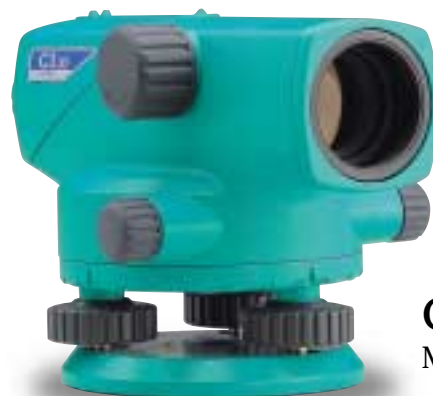
C330 Magnification 22x