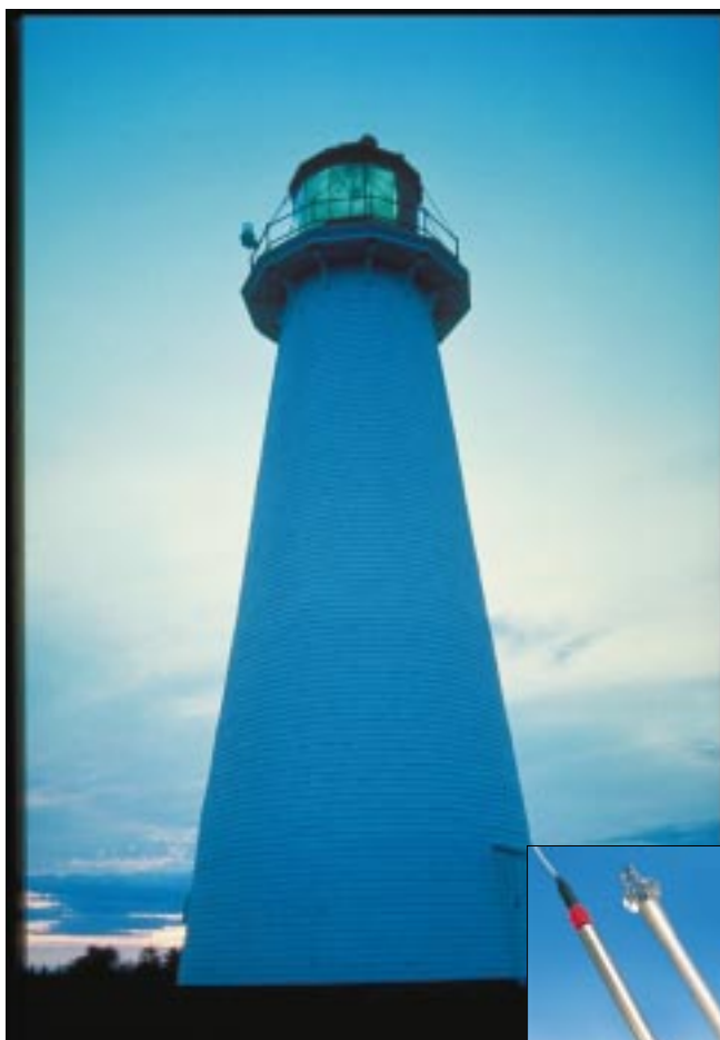
SOUND VELOCITY PROFILER

WHEN IT'S ALL ABOUT GETTING THE RIGHT SIGNAL