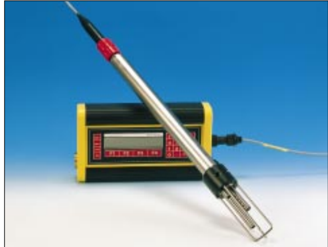
HMS 1820-CTD/C and HMS 1820-H Hand Terminal

Finally, the HMS 1820-H Hand Terminal is used for calibration of the Sound Velocity Profiler.