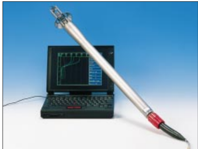
HMS 1820-CTD/W and a laptop

The CTD Master is standard with the HMS 1820-CTD/W. This software program enables a detailed analysis of the water column to be carried out as well as presenting this analysis in a diagram or a table. The following results are displayed in tables: Depth, temperature, sound velocity, salinity and conductivity.