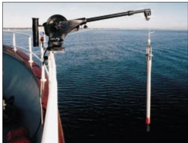
HMS 1820-CTD/W and a »smart winch«

The HMS 1820-CTD/W is available to carry out profiles down to depths of 500, 750 and 1,000 metres.